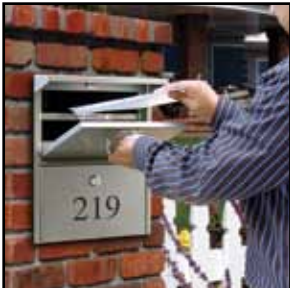
Front view of (#4325D) mounted in a column with custom numbers / letters (see page 103) displayed

Made entirely of aluminum, Salsbury U.S.P.S. approved 4300 series designer roadside mailboxes feature both a front and rear access locking door. Available in a powder coated bronze, copper, brass or nickel finish, each unit includes an outgoing mail tray, a lock with two (2) keys on each door (keyed alike) and an adjustable burgundy signal flag. Mail is deposited through a non-locking access panel on the front. Designer roadside mailboxes can be mounted on the optional bolt mounted (#4365D) or in-ground mounted (#4385D) aluminum designer pedestals, in-ground mounted aluminum designer deluxe posts (#4370D, #4372D, #4373D and #4374D) or a base of your choice. Designer roadside mailboxes can also be mounted in columns, masonry or walls. Designer newspaper holders (#4315D) and non-locking thumb latches (#4388) are available as options upon request. Designer roadside mailboxes are approved for U.S.P.S. curbside mail delivery. Master postal lock not required.