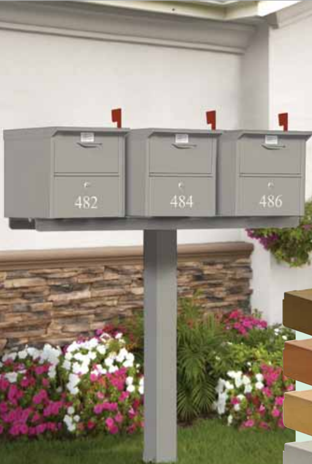
(3) #4325D's on a three (3) wide spreader (#4383D) attached to an in-ground pedestal (#4385D) with custom numbers / letters (see page 103) displayed