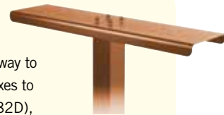
#4382D on a designer pedestal (#4365D) displayed

Made of heavy duty aluminum, Salsbury designer spreaders are an ideal way to mount multiple designer roadside mailboxes to pedestals. Optional two (2) wide (#4382D), three (3) wide (#4383D) and four (4) wide (#4384D) spreaders easily attach to standard pedestals (#4365D and #4385D).