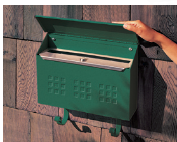
#4615 with privacy plate (included) and optional security kit (#4611) displayed