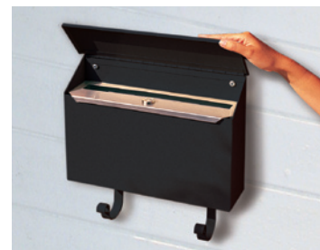
#4610 with optional security kit (#4611) displayed