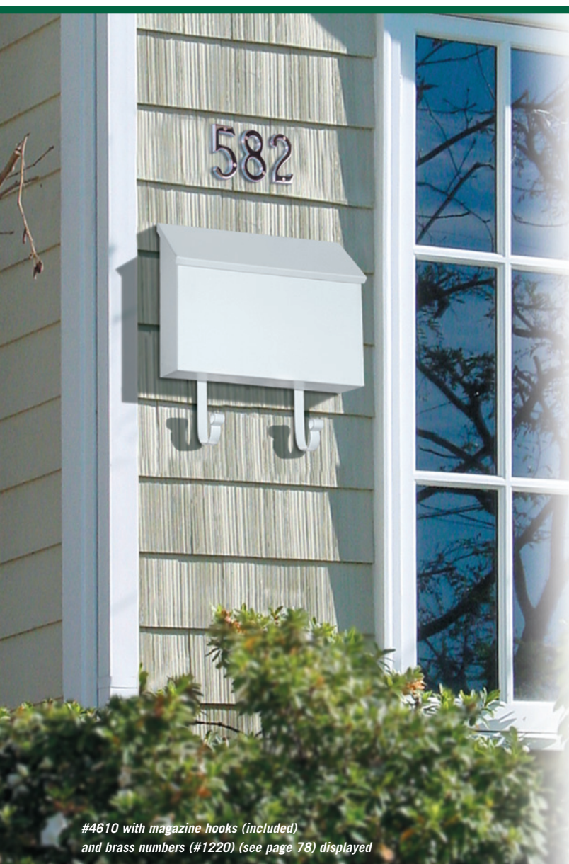
#4610 with magazine hooks (included) and brass numbers (#1220) (see page 78) displayed