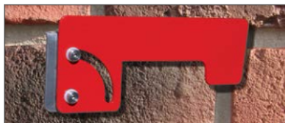
Stainless Steel Masonry Flag with bracket. Flag dimensions: 1-1/2" x 7". (MF-1450)