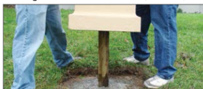
Stucco column ready to install over 4" x 4" post.