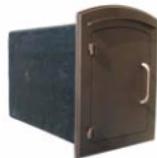
Oversized masonry box included