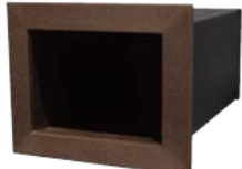
Newspaper box: aluminum frame with black masonry box. Frame: 11" x 9-1/4". Insert: 9" x 7" x 15-3/4". (NEW-1415)