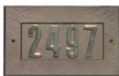
Matching cast aluminum address plaque: 3" gold polished brass numbers. 11" x 6-1/2". (ADD-1410)